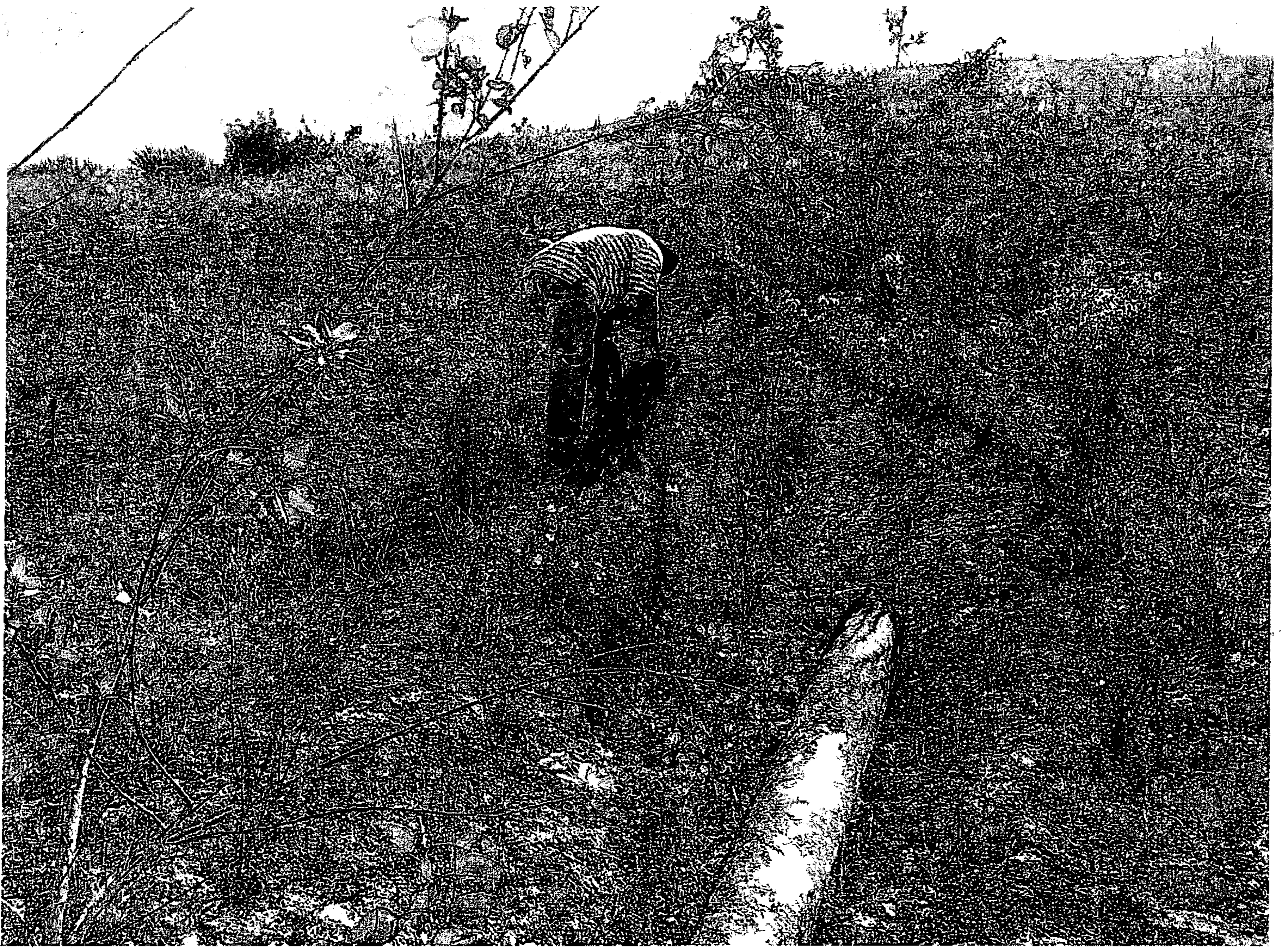
CF63 - looking well in Phase 2B